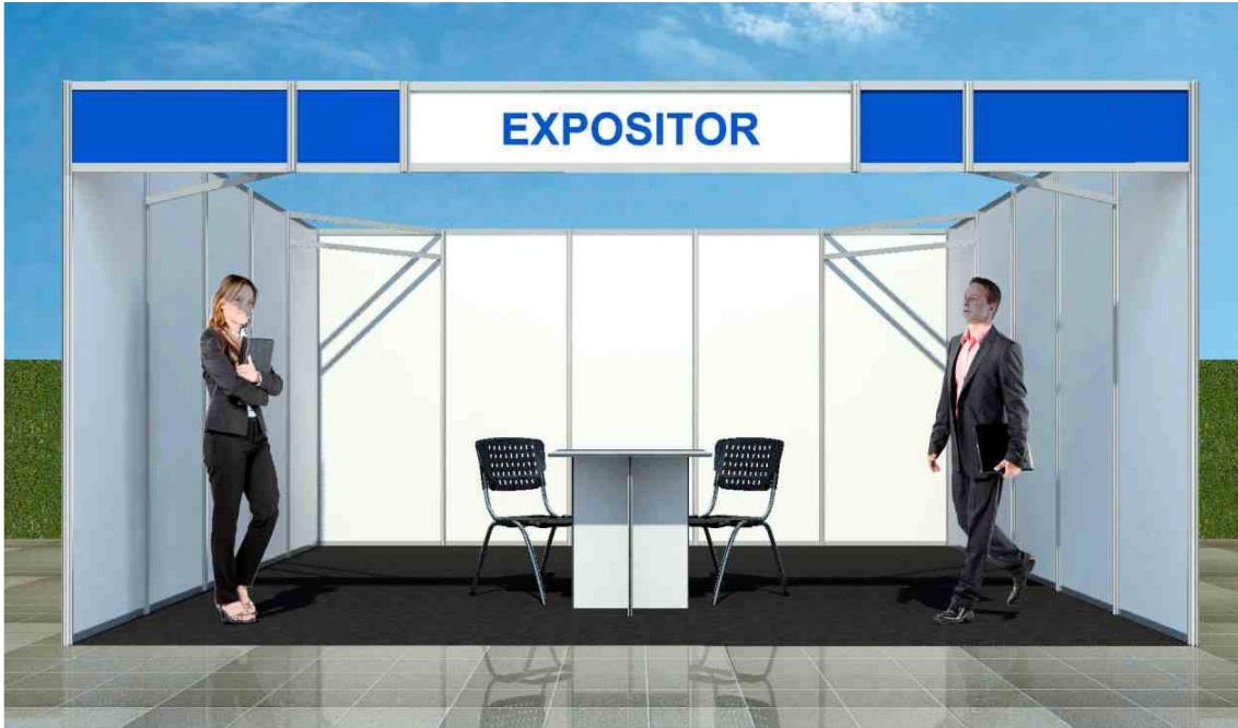
■ Stand Aeronave 20 x 20 400m 2